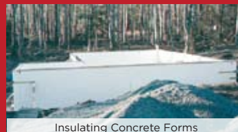
Insulating Concrete Forms